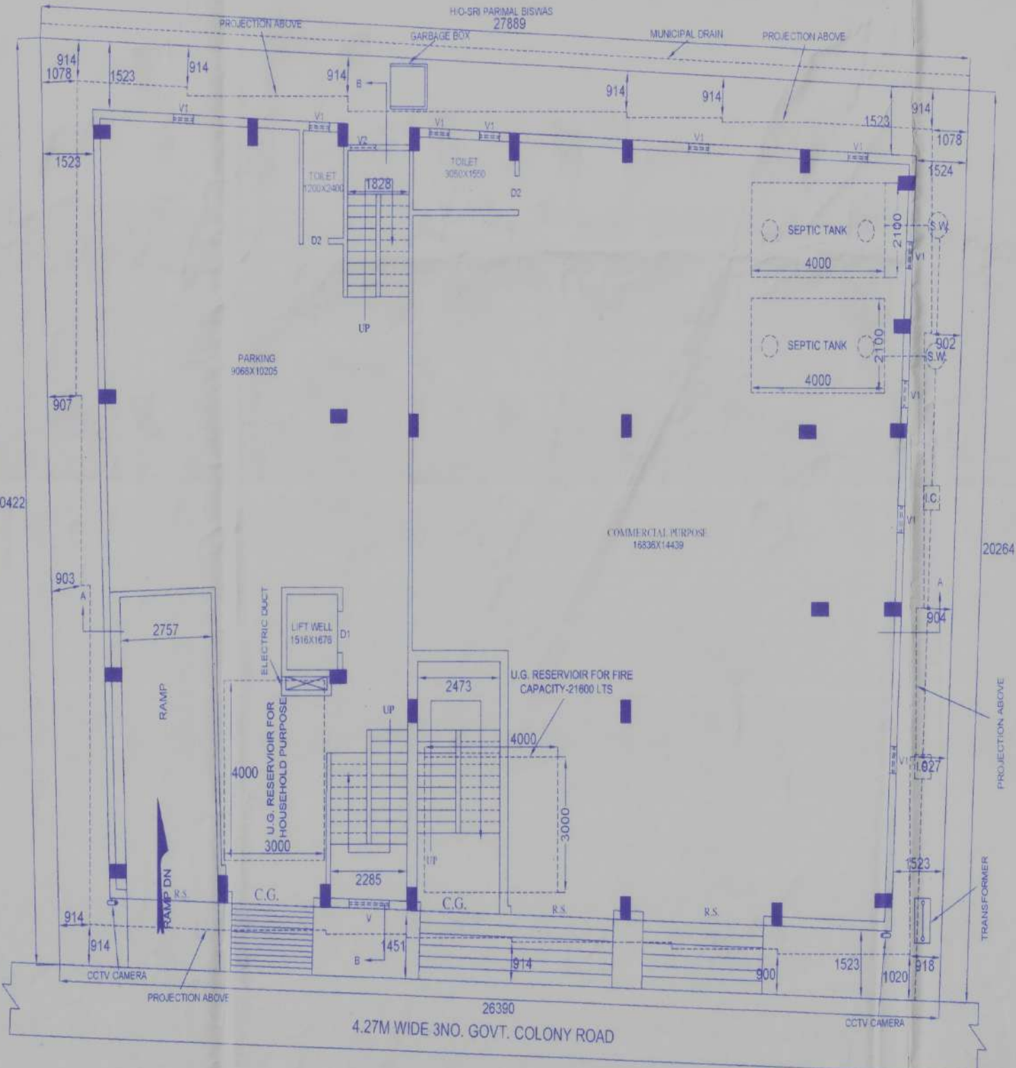
PROPOSED GROUND FLOOR PLAN SCALE-1:100