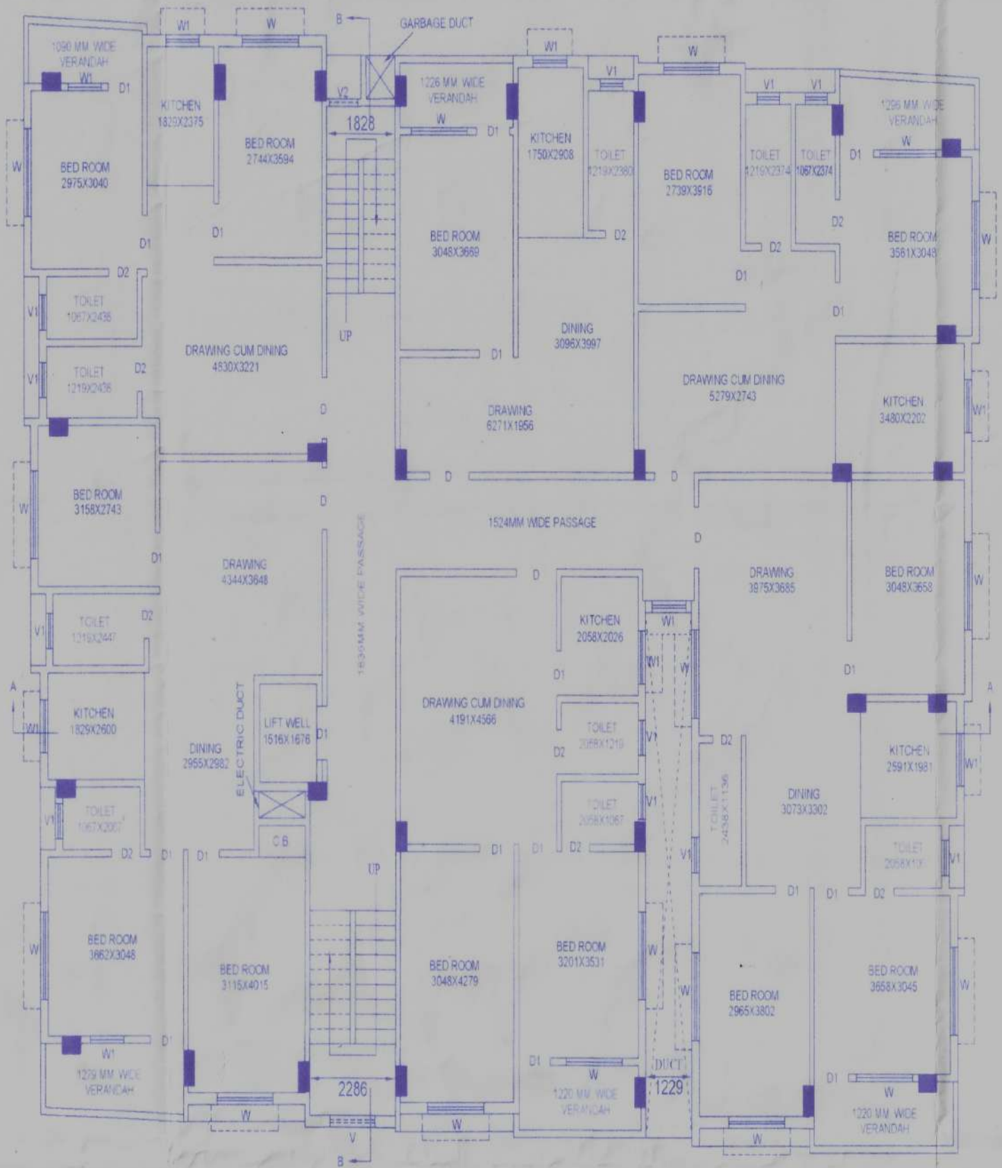
PROPOSED 2ND., 3RD. & 4TH. FLOOR PLAN SCALE-1:100